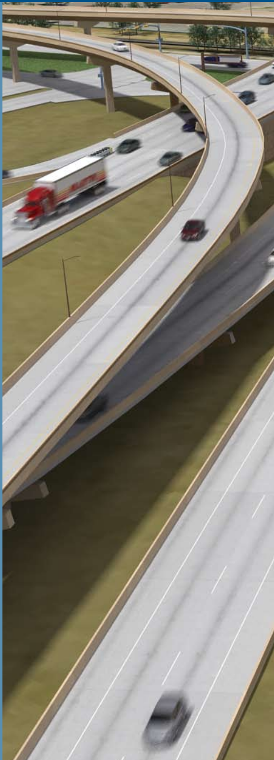
View of project at SH 26

The DFW Connector includes state highways 114 and 121 and adjacent roadways located north of DFW Airport. This area, which sits near the intersection of the area's four most populous counties, is a vital connection for North Texas business, commercial and recreational interests.