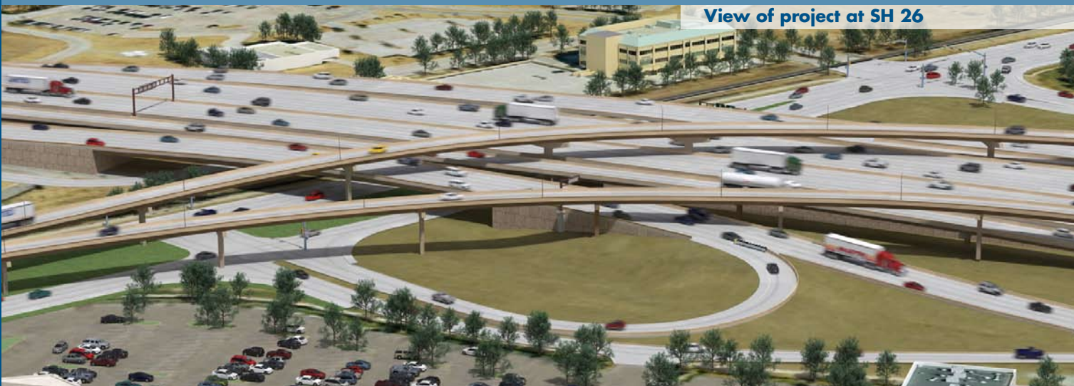
View of project at SH 26

The DFW Connector is being designed and constructed by NorthGate Constructors, a joint venture between Fort Worth-based Kiewit Texas Construction, L.P., and San Antonio-based Zachry Construction Corporation. NorthGate Constructors is an equal opportunity employer.